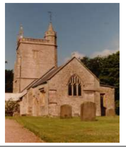
ALL SAINTS HINTON BLEWETT, NOW SAINT MARGARET'S