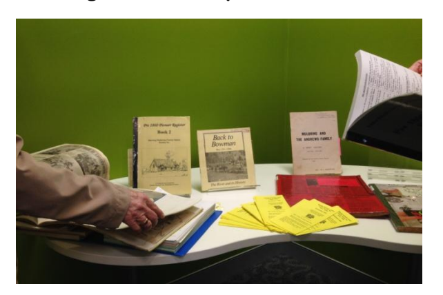
Display of memorabilia