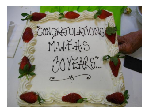
The Birthday Cake

Attached is a selection of photos from the 30<sup>th</sup> birthday celebration.