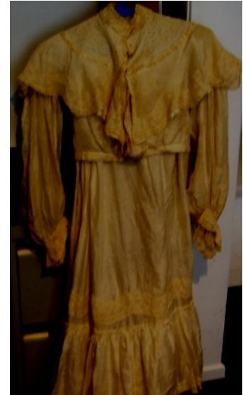
The Wedding Dress