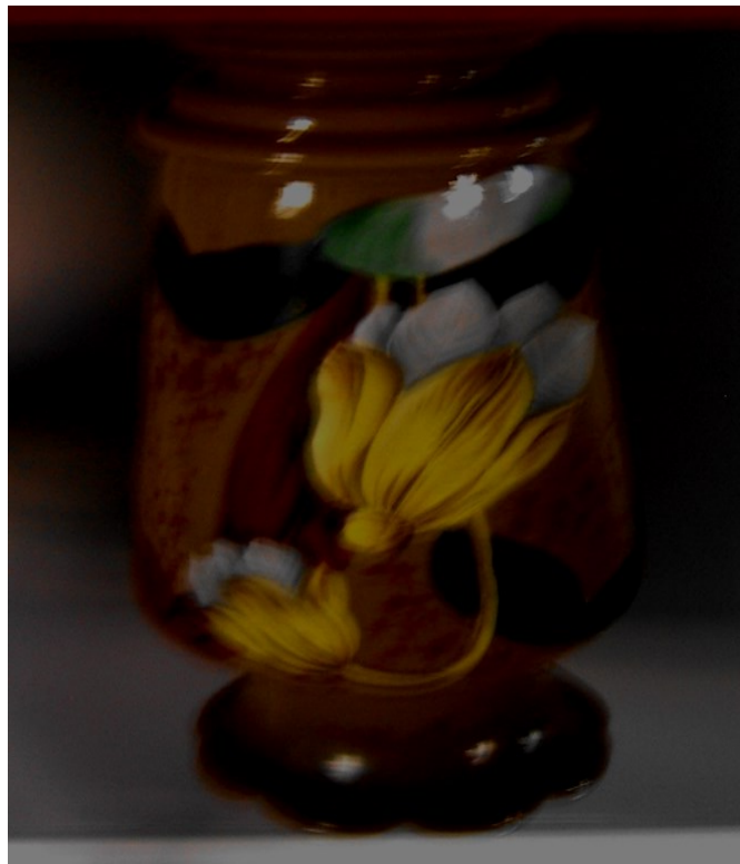
Matching Pair of Hand Painted Vases

I have no idea of their value, but I treasure them..