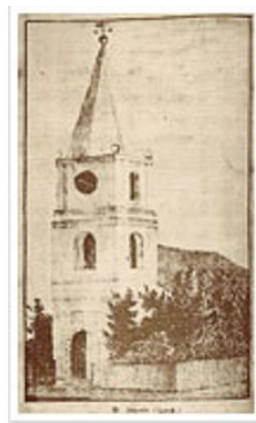
St Davids Church Hobart