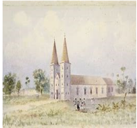
St John's Church., Parramatta.